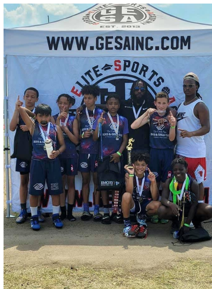
Our Boys 12U Flag Football team snagged the first championship of the year (above). Our Girls Flag Football team scored a VIP invitation to the first ever National Association of Intercollegiate Athletics Women's College Flag Football Championship (right).

100% of the Club's basketball players reported they learned new skills (or improved skills), and felt like the coaches listened to and cared about them, pushed them to do their best, and wanted them to be successful. 100% of parents believed their children felt more invested in the Club and felt an increased sense of camaraderie. Heard around the Club: 100% of the coaches and staff were grateful to host a safe basketball season.